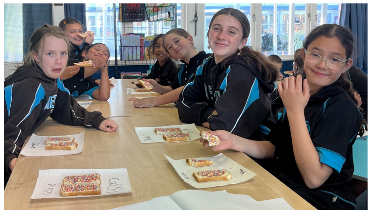
Everybody loves making fairy bread