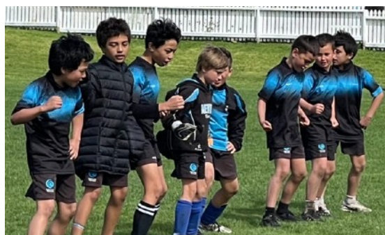
Winter Tournament - Competitive Football Team