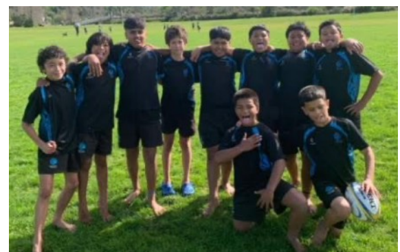
Winter Tournament - Touch Team