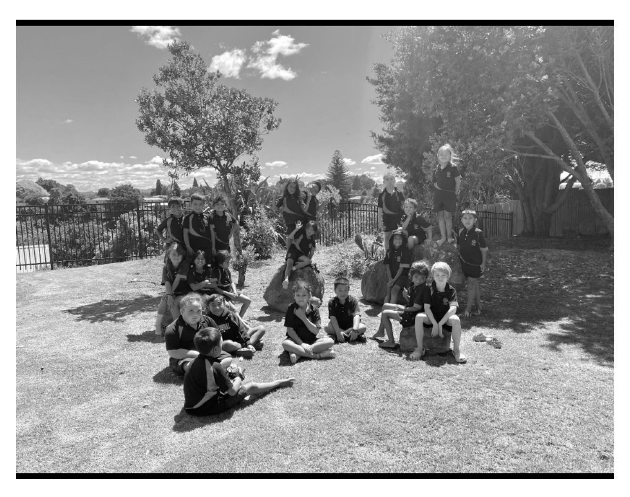
ROOM 4 were excited to be back at school